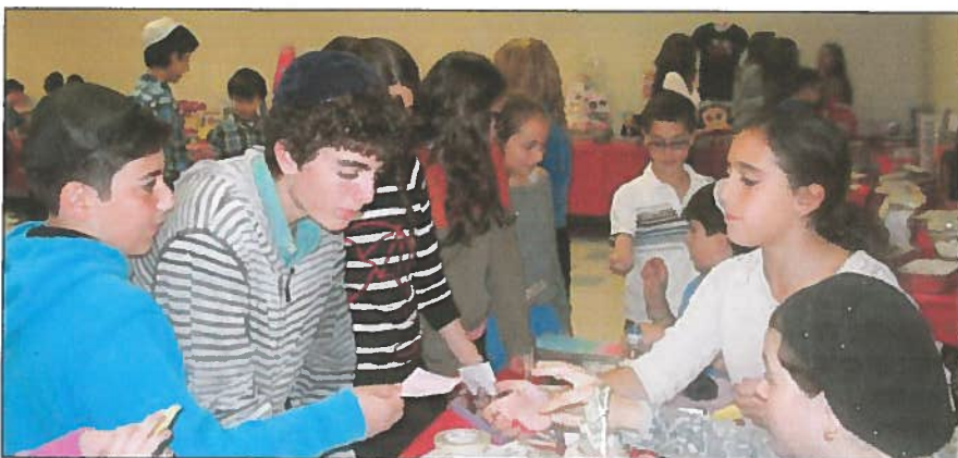
Kids surrounding the ticket tables